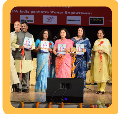
Fundraising for a Cause