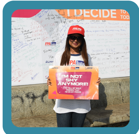
Volunteering and Advocating for a cause