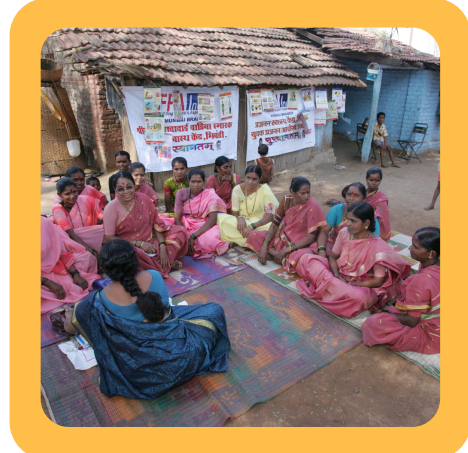
Working with Communities

FPA India can partner with your organisation to deliver cost-effective and impactful projects that support your CSR objectives. You could show support by: