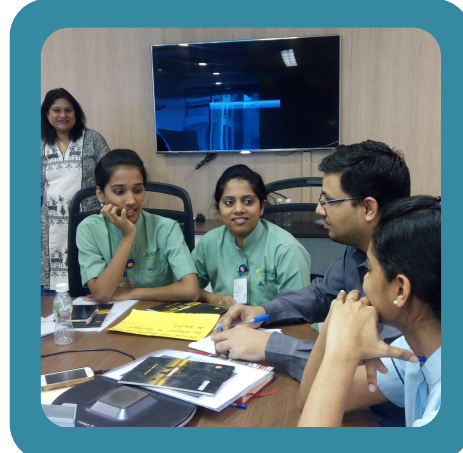
Training and Capacity Building